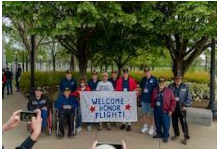
Honor Flight #72 Participants with the Lincoln Memorial in the background.