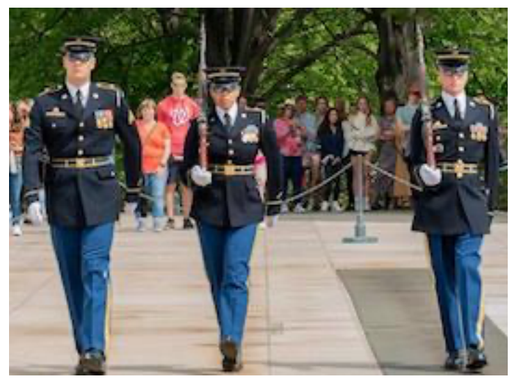
Changing of the Guard, Tomb of the Unknown Soldier