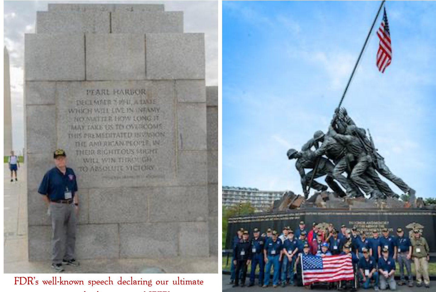
victory at the beginning of WW2.