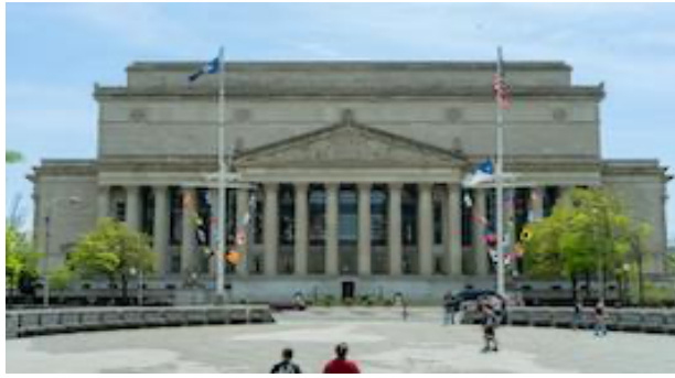
United States Archives