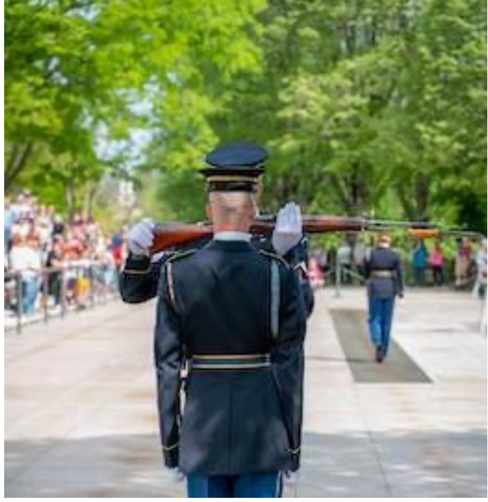
Tomb Guard Weapon Inspection