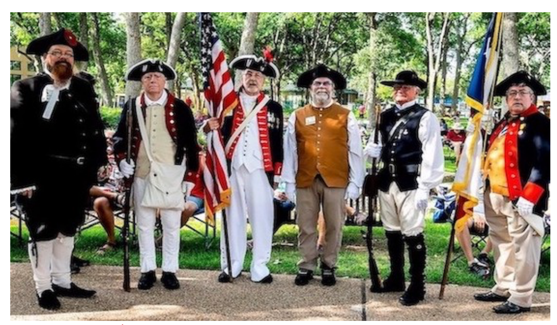
On Memorial Day, May 30<sup>th</sup>, 2022 our color guard posted the colors during ceremonies at the Veterans Memorial Plaza in Sun City. 3 of our guard members pictured are veterans.

Congratulations to all of our award recipients!