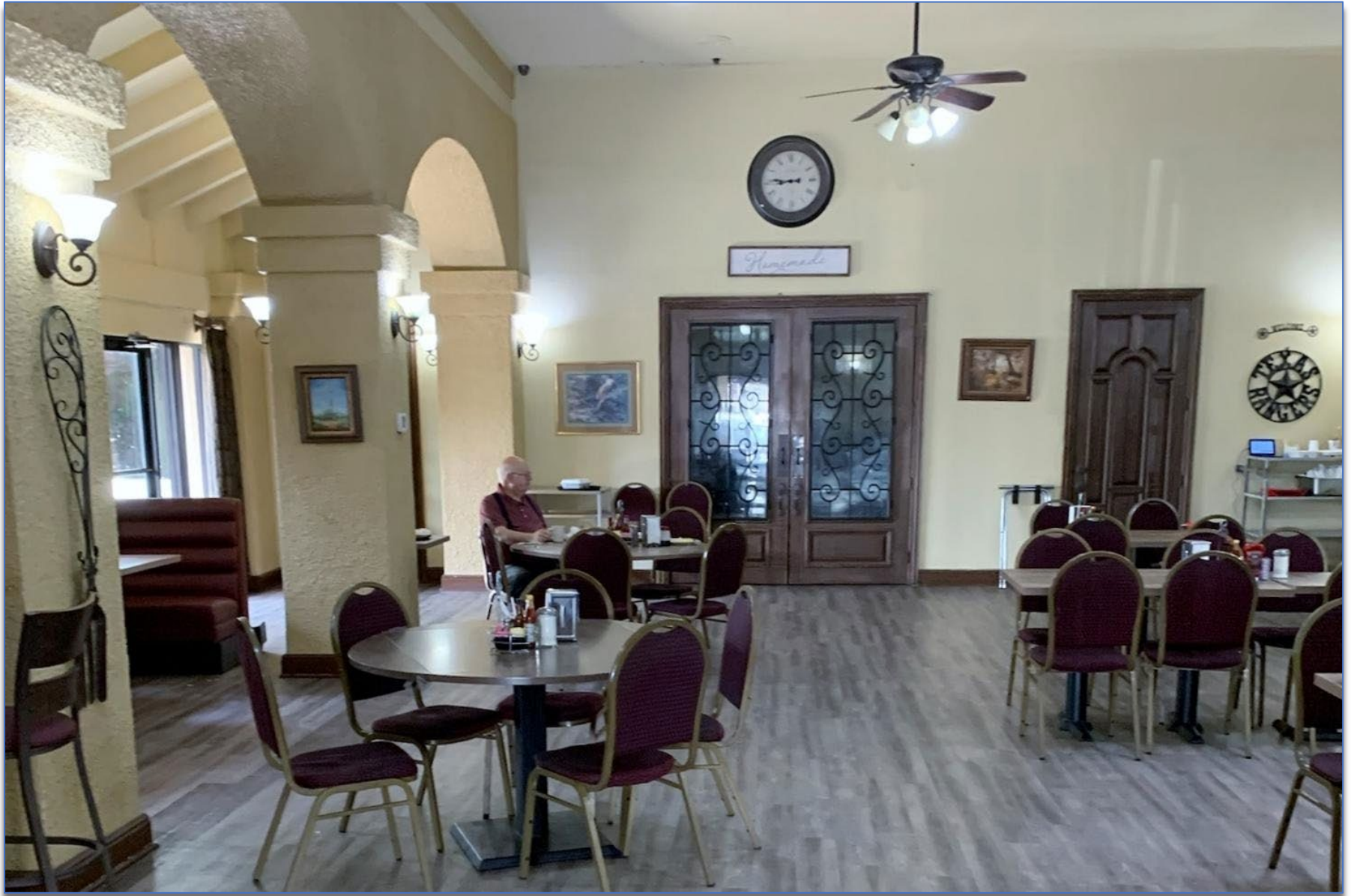
Front Public Dining Room (rear doors lead to Private Dining Room)