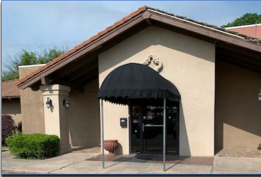
Skillet-N-Grill Café Large Parking Lot