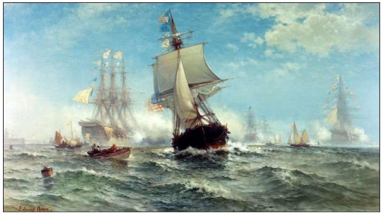
This painting represents the French fleet saluting the American ship Ranger in February 1778. The first American flag ship to be recognized by the French.

Eight ships of the "American" navy set sail for the Bahamas. The goal was the seizure of gunpowder kept at the British armory in New Providence. Additional American ships were reported by British agents to have ported in Spain to acquire war material. On February 28<sup>th</sup> the Spanish crown gave orders to his fleet in the west indies to set up patrols so that British ship movements could be monitored. Said intelligence would then be given to the French and, through the French, to the Americans.