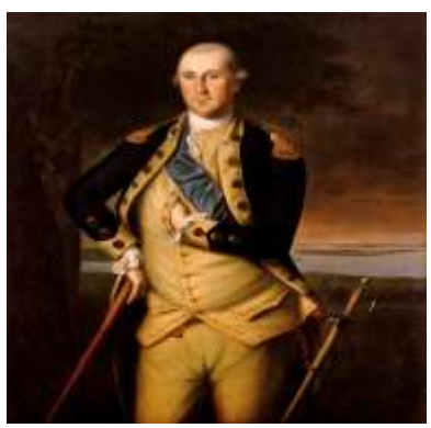
1776 Withdrawal through New Jersey

December 21<sup>st</sup> the British Parliament passes a bill calling for the confiscation of all American vessels, and the impressment of their crews, into service in the English Navy. The next day they pass the American Prohibitory act. King George III then issues a royal proclamation December 23<sup>rd</sup> closing the American colonies to all commerce and trade, to take effect in March of 1776.