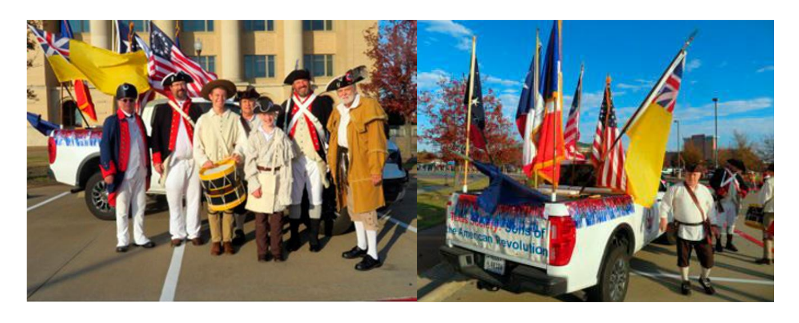
4 December 2021 Christmas Parade in Rockwall