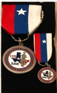
125 th Anniversary Medal Set

We have Metal and Wood Challenge Coins, 125 th Anniversary Medal Set, and an SAR House Banner to aid our Chapter in the efforts raise money for our youth programs.