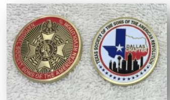
Dallas Challenge Coins