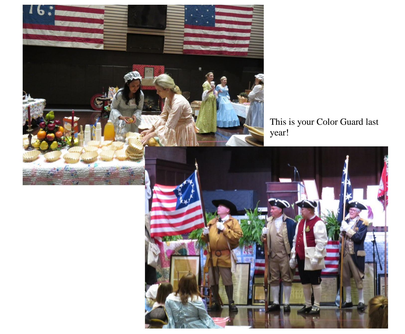
April 13 will be Colonial Day at Providence Christian School.