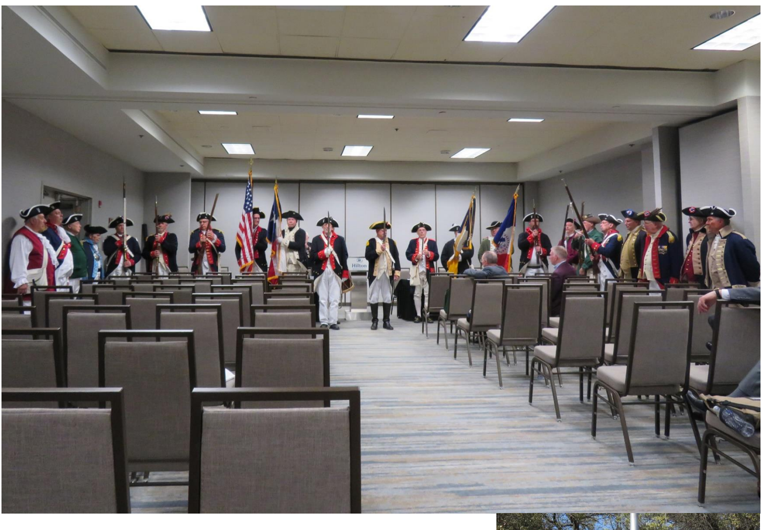
Presentation of the Colors

The State Convention in Richardson Texas March 31 - April 3