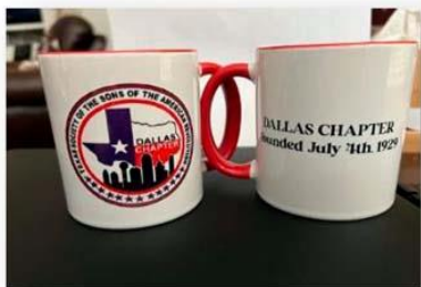
New Dallas Coffee Mugs

Remember; "An artist is not a special kind of person, but every person is a special kind of artist."