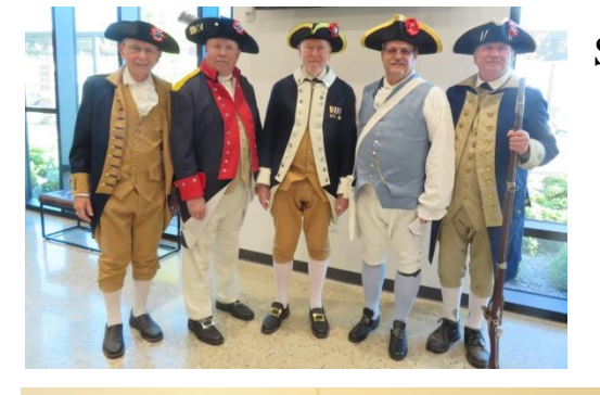
September 16, 2022 -Faith Lutheran School Constitution Day

September 15, 2022 Constitution Day with the DAR in Plano