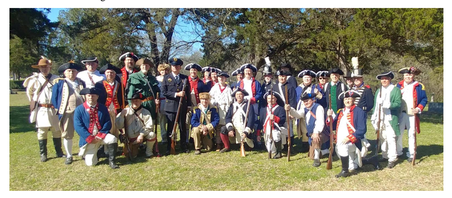
March 31 – April 2 TXSSAR Annual Conference Spring, TX