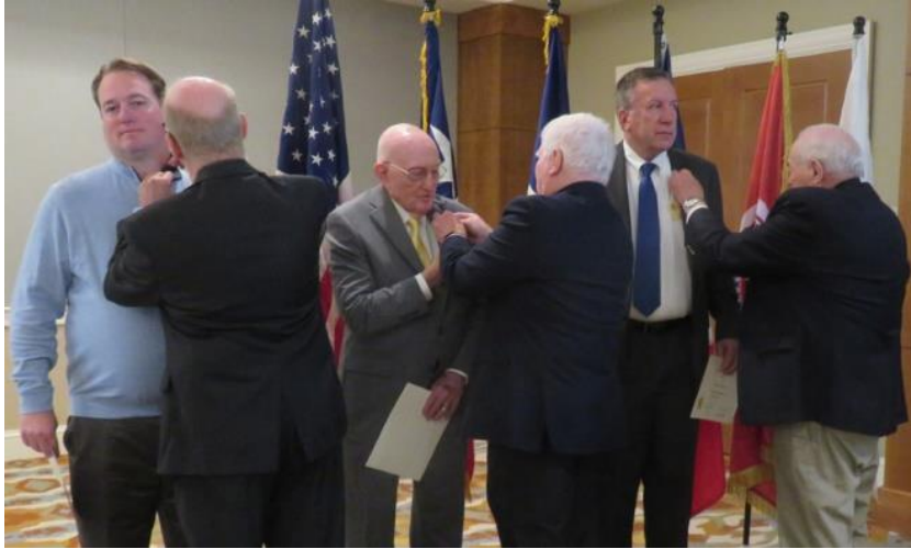
New Dallas Chapter members being pinned.