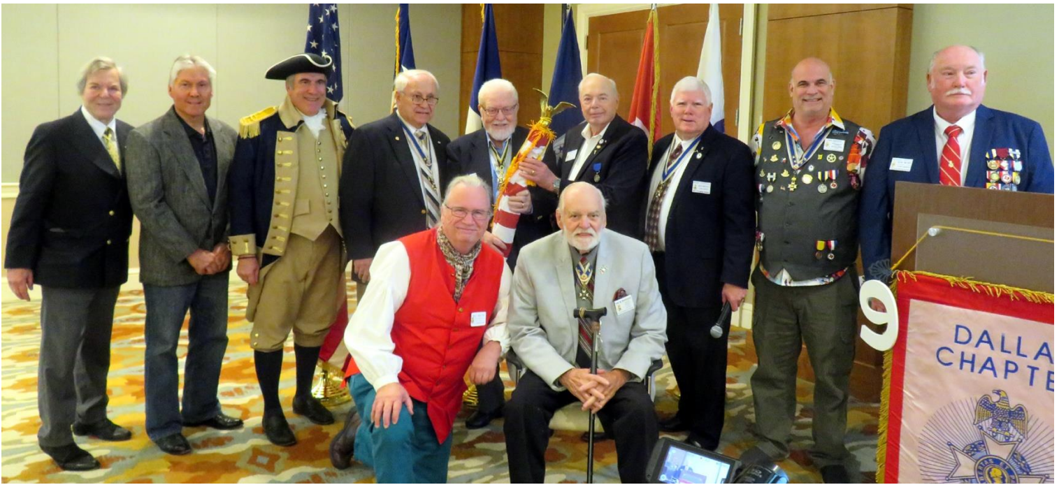
Men who are associate members of the new Ellis County Chapter SAR