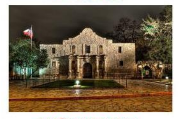
SAVE THE DATE! APRIL 11 TE = APRIL 14TE IN SAN ANTONIO, TEXAS

DOUBLETREE BY HILTON = SAN ANTONIO AIRPORT 611 NW LOOP 410, SAN ANTONIO, TX 78216