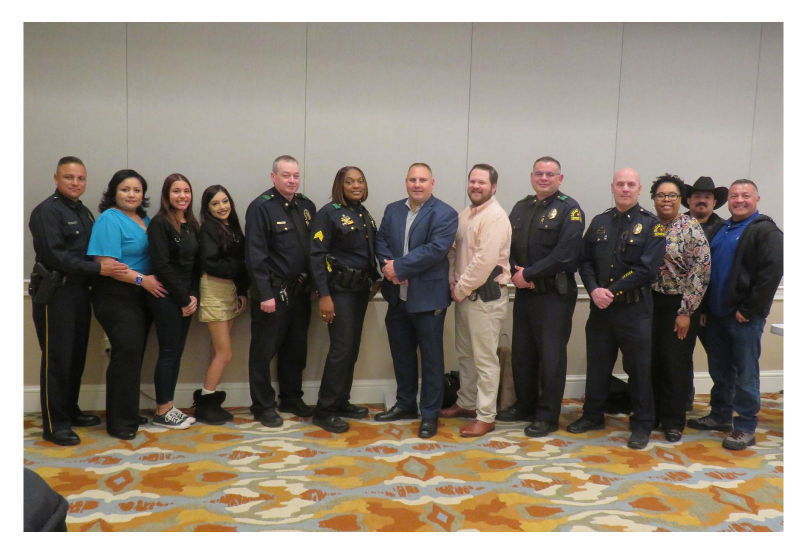
2024 DALLAS POLICE DEPARTMENT

There was a special drawing for door prizes – Police and Fire Department only!