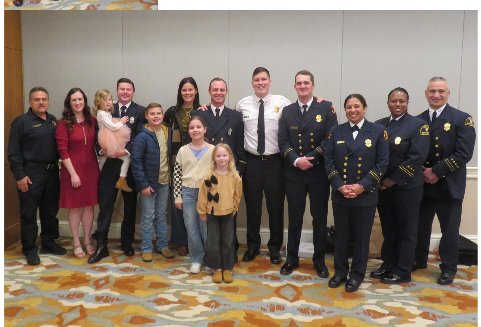
2024 DALLAS FIRE DEPARTMENT AND EMERGENCY MEDICAL SERVICES