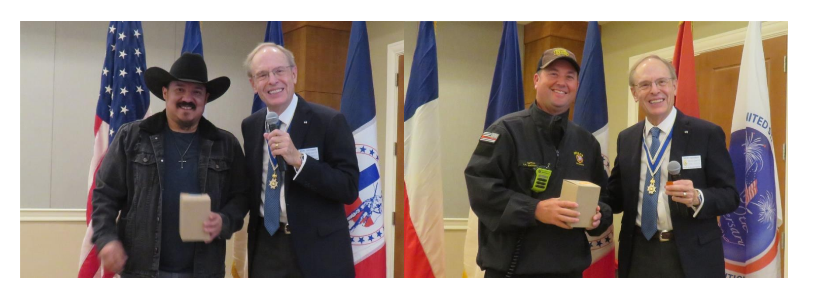
Police and Fire Drawing Winners!

There was a special drawing for door prizes – Police and Fire Department only!