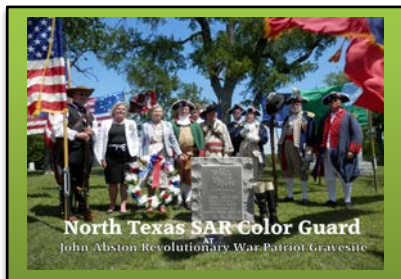
ABSTON GRAVE REDEDICATION