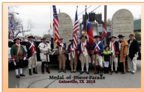
Medal of Honor Parade Gainsville, TX 2018