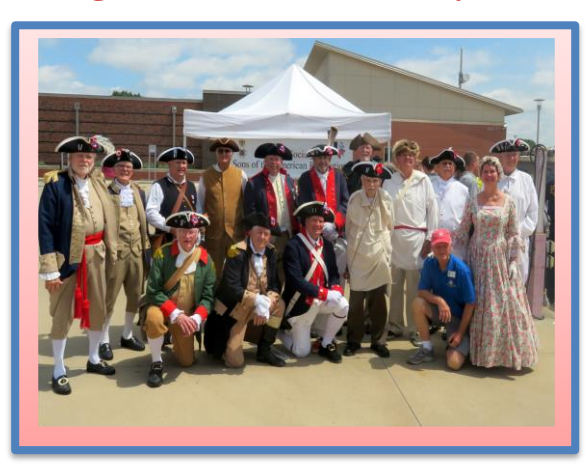
*Flag Retirement Ceremony