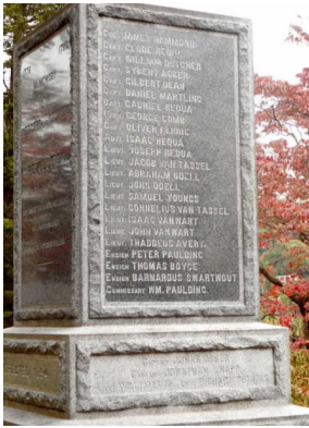
Revolutionary Soldiers Monument Tarrytown, NY