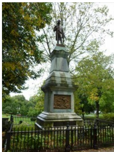
Captors Monument Tarrytown New York