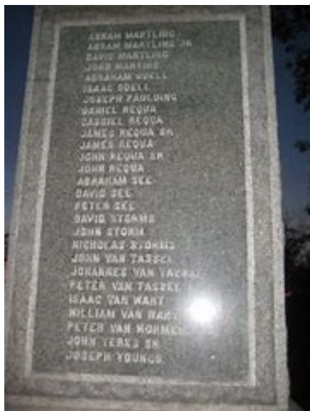
Revolutionary Heroes Monument Tarrytown, New York