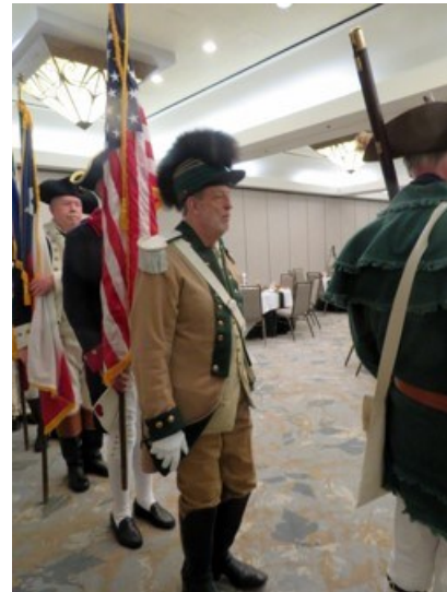
Texas SAR Convention