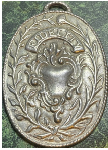
Fidelity Medal Issued by Congress to the Captors of Major John Andre'

Our Next meeting will be at Soulman's on I-30 in Rockwall Thursday, August 11th, 2022 at 7:00 p.m.