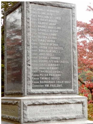
The Revolutionary Soldiers' Monument Dedicated at Tarrytown, NY October 19th, 1894