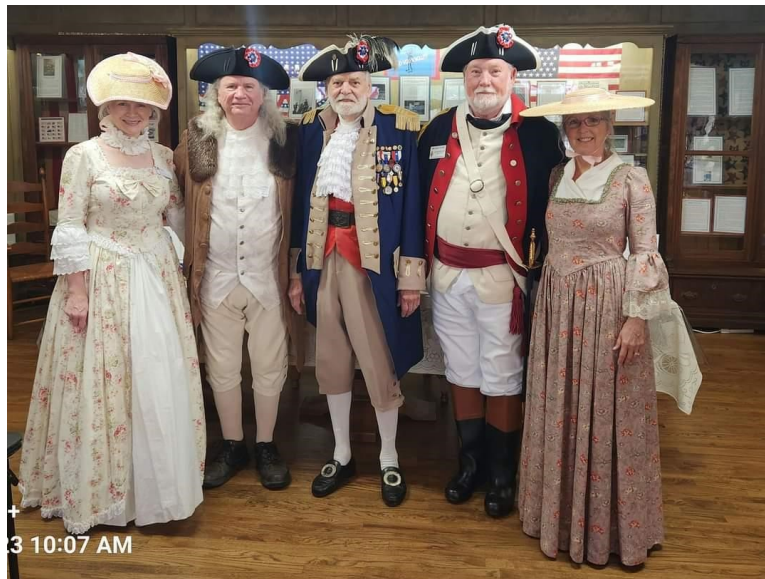
SAR/DAR educational program at the DAR House Fair Park for the Frisco ISD 7th and 8th graders .