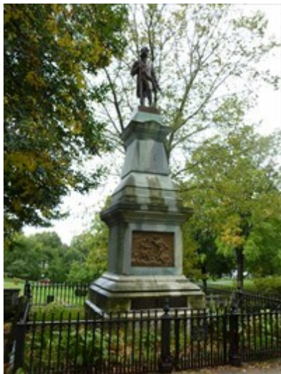
Captors Monument in Tarrytown, NY