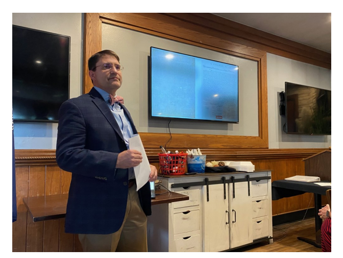
Sons of the American Revolution . East Fork Trinity Chapter #47 . July 2023 Page 2