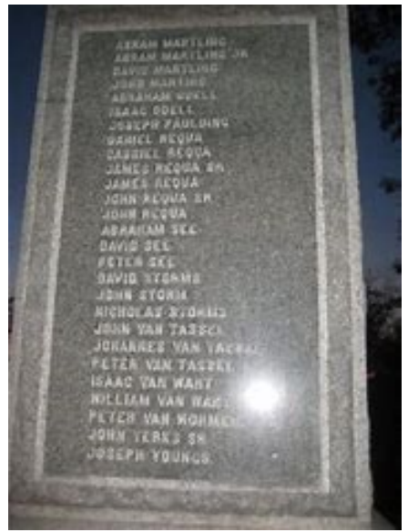
Revolutionary War Heroes Monument Tarrytown, NY

Sons of the American Revolution . East Fork Trinity Chapter #47 . July 2023 Page 5