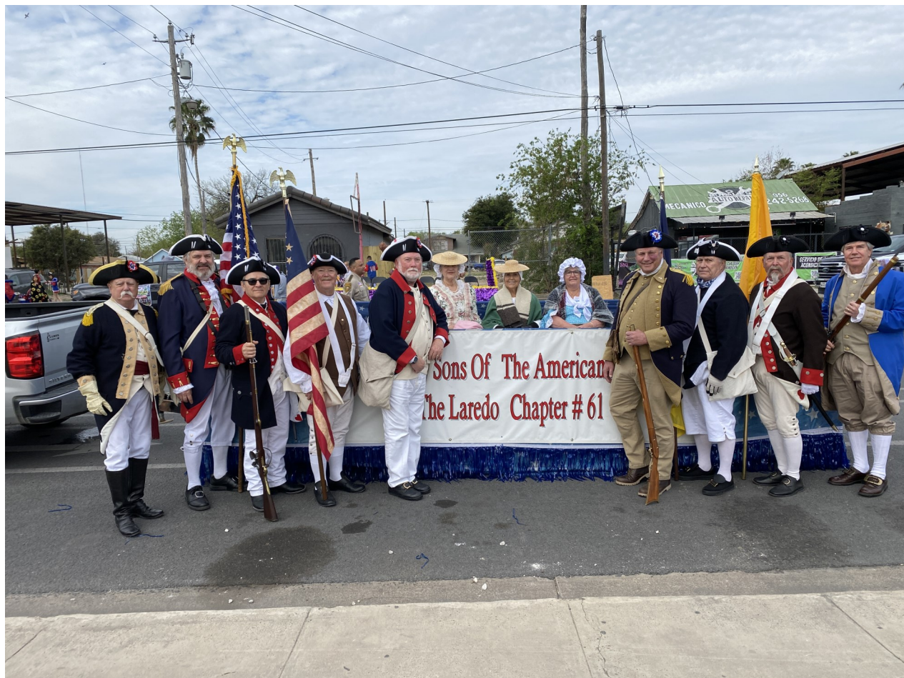
George Washington Birthday Parade in Laredo, Texas