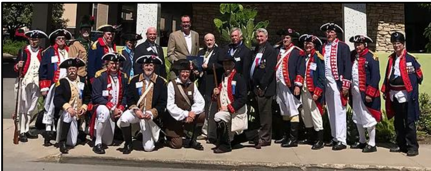
Members of the Texas SAR Color Guard at the Sons of the American Revolution Convention in San Antonio, Texas in April 2017