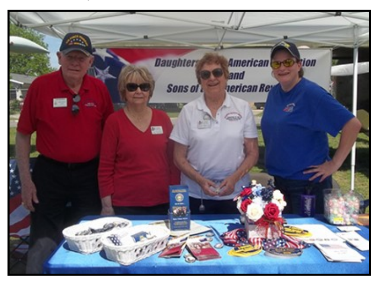
DAR and SAR chapters in the Fort Worth area at their booth at the Hops and Props 2018 held on April 28th at the Fort Worth Aviation Museum. The Hops and Props Veteran Recognition and Craft Beer Festival is a family-oriented event with live music, food, craft beer, family-oriented vendors, Veteran Support Groups, airplanes, and more.