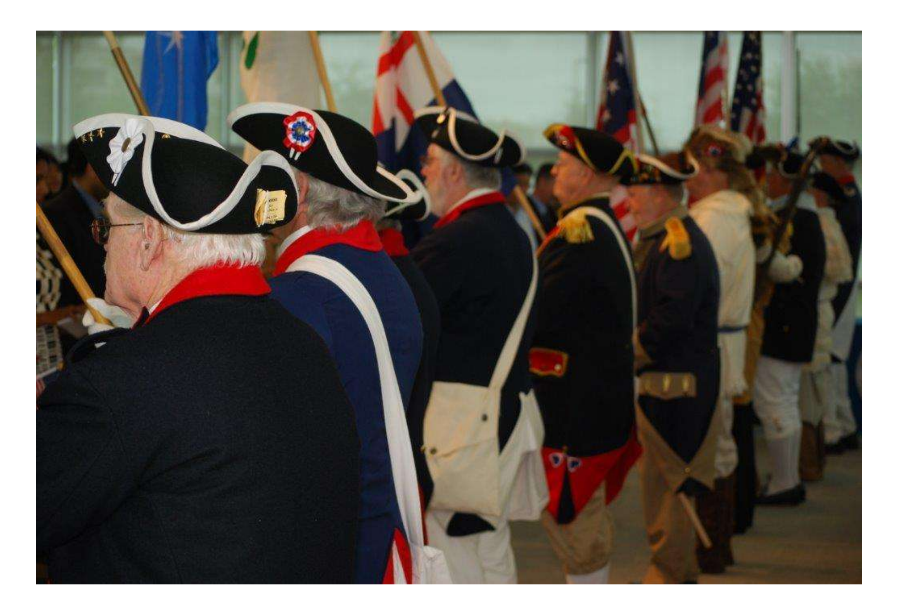
OUR BEST SIDE