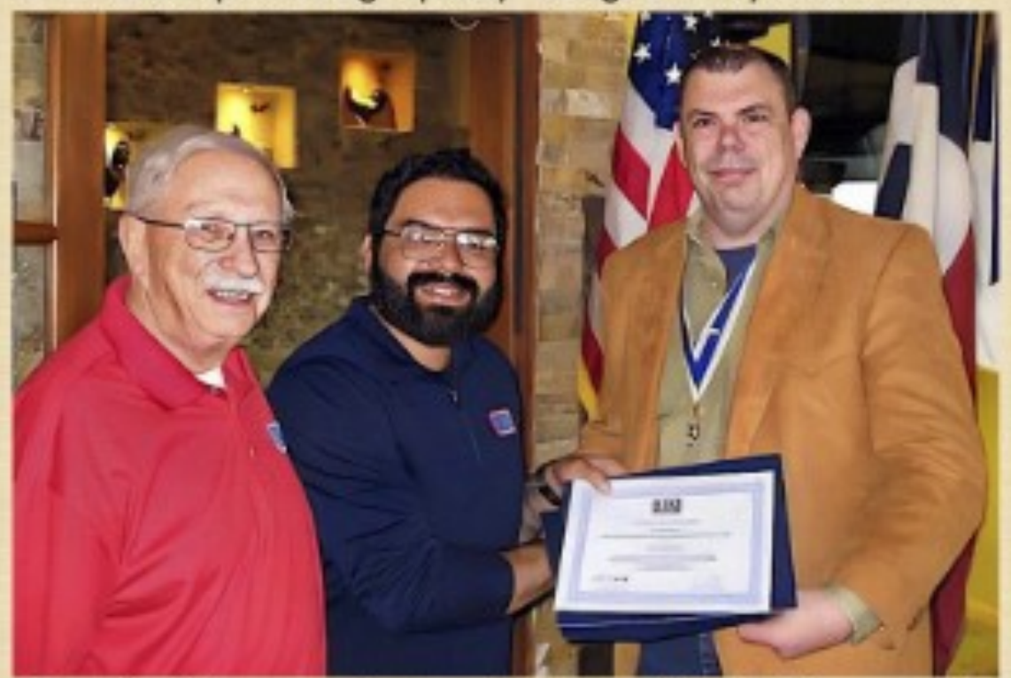
Speedy giving our chapter a USO certificate of appreciation