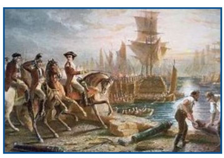
British Leaving Boston

Go to the National Archives Website to see