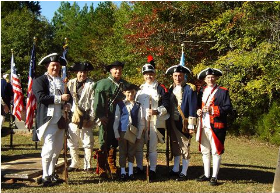
PineyWoods Members with GASSAR and GASSAR members

The PineyWoods Chapter TXSSAR has dedicated three graves of Revolutionary War patriots in the past few years. The purpose of SAR is to preserve and perpetuate the stories of American patriotism. Information on the PineyWoods chapter can be found on their website.