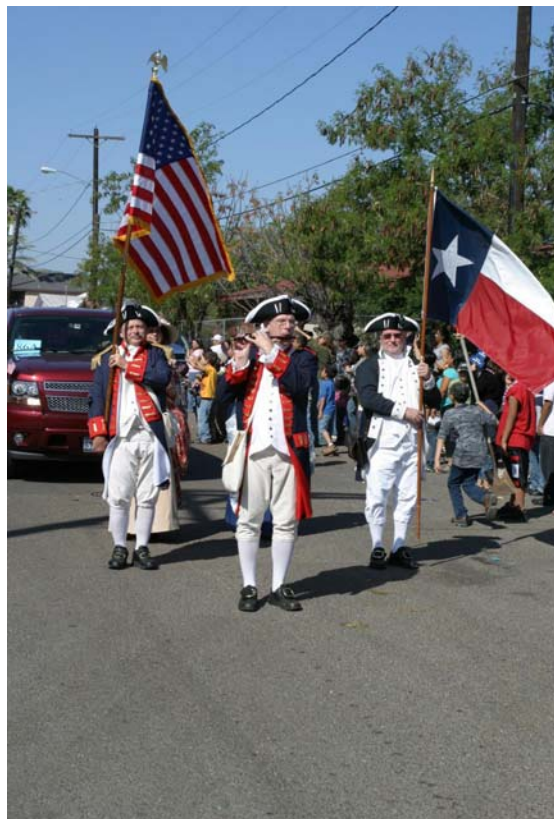
PineyWoods Color Guard participating in the George Washington Parade in Laredo Texas February 23, 2008