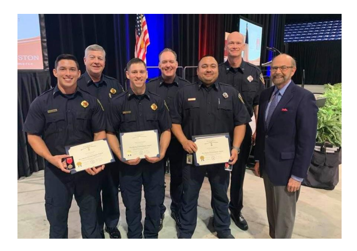
The Fire Safety Commendation and Medal is presented to an individual for accomplishments and/or outstanding contributions in an area of fire safety and service. Cy-Fair Volunteer Fire Dept. Ladder 13 and Engine 8.