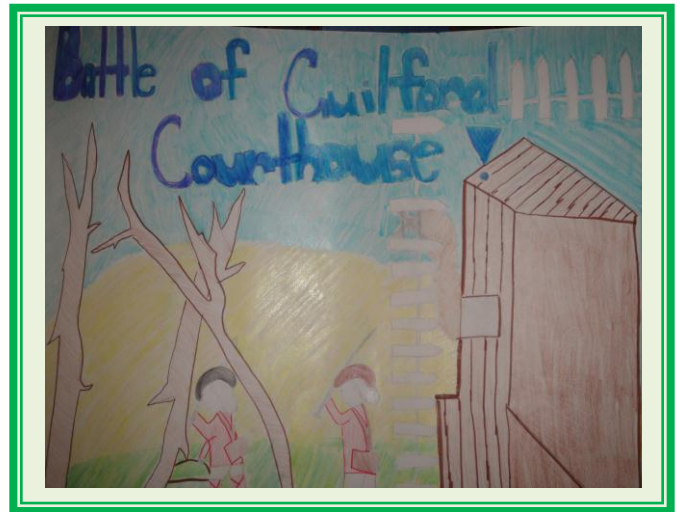
Rankin Second Place Poster is Above

From 175 submitted posters, the following were selected to proceed to the state convention, replete with publicity release forms, were: