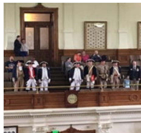
SAR compatriots in Texas Senate chamber.

We can provide chapters with an example proclamation.