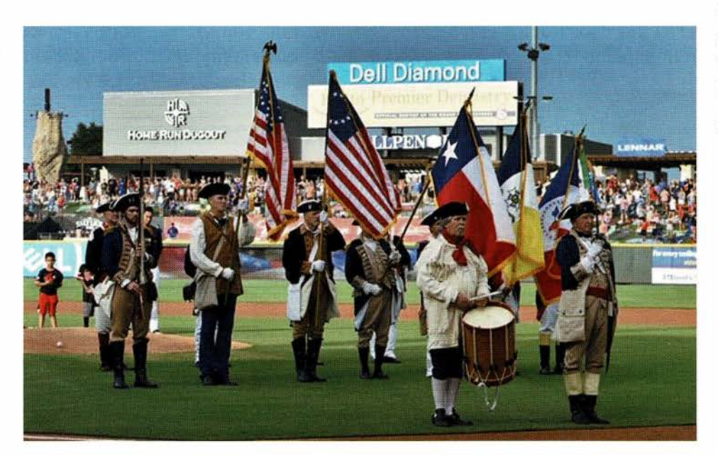
Members of the combined Central Texas chapters once again provide the Color Guard for the July 4 baseball game at Dell Diamond in Round Rock. The game capped off a day-long schedule of appearances in parades in Wimberley and Austin.