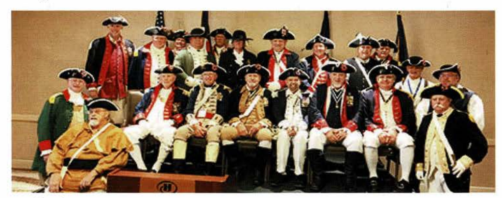
The Sexas Compatriot

We mustered 42 members in uniform from 15 chapters at this BOM.