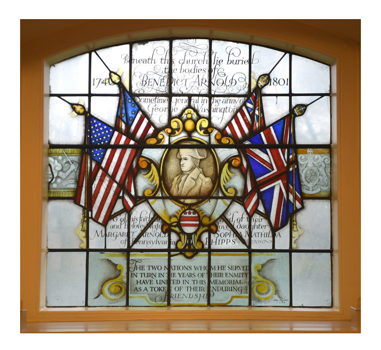
Benedict Arnold memorial window at St. Mary's church, Battersea, London, England