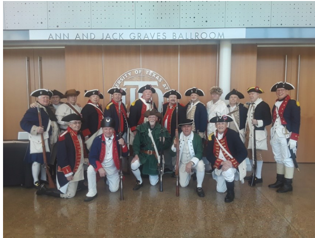
Photo: Naturalization Ceremony in March 2023 at UTD.