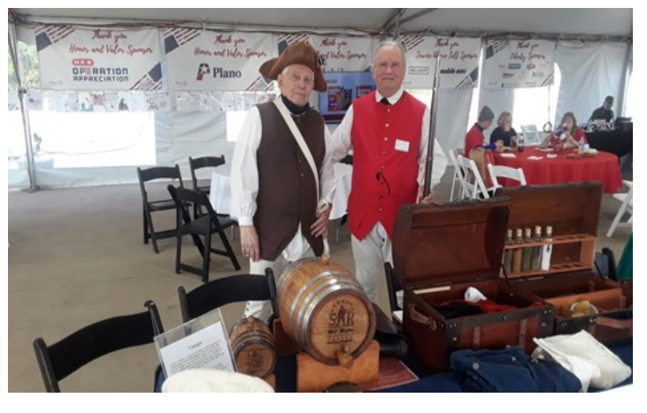
Flag of Honor, Plano, November 11