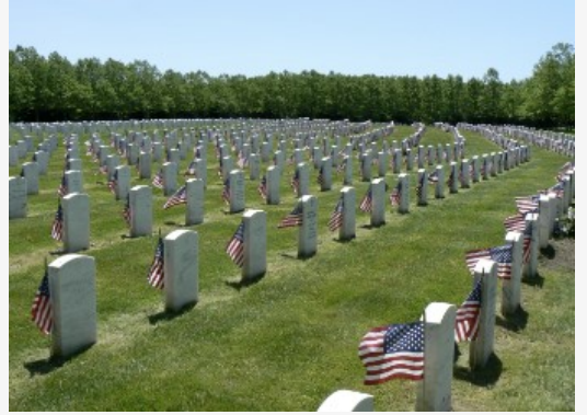
AS we prepare to observe Memorial Day, and remember that Freedom is Not Free. We also pay tribute to those who paid the ultimate sacrifice to our Nation.

Texas is a large, active, and diverse society with fortyeight chapters located around the state. We are always looking for new members and leaders who can assist us in celebrating what our founding ancestors did!