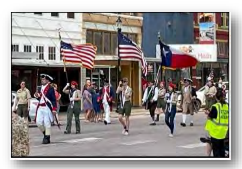
2022 Memorial Day Denison Texas