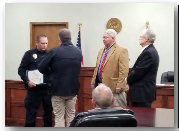
Law Enforcement Medal Presentations

Eagle Scouts and Public Servants in Law Enforcement are presented NSSAR Medals in recognition of their outstanding performances and commitment in the State of Arkansas