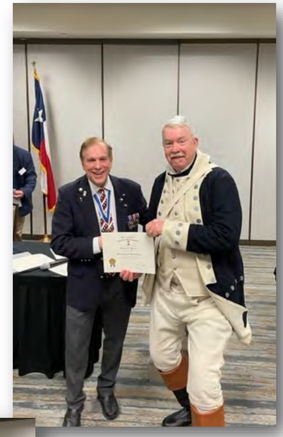
GAINESVILLE MEDAL OF HONOR 2022