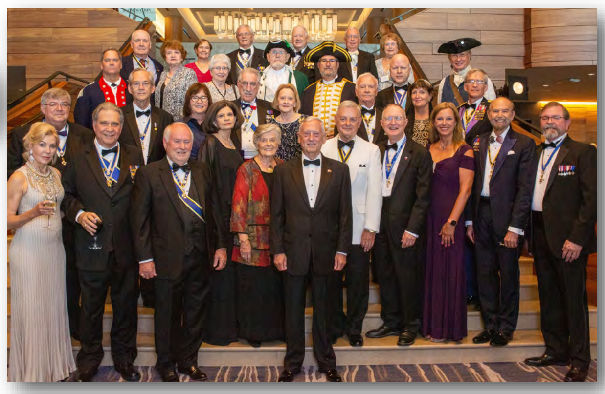
General James "Mad Dog" Mattis posing with Texas Congress attendees