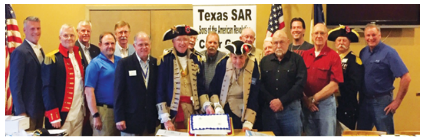
Hightower Chapter #35 members gathered to celebrate their 35th anniversary.